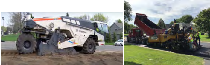
Reclamation of existing asphalt

Once the roadbed has been reshaped paving crews will install the first layer of asphalt. After a few weeks or months the contractor will install the final layer of asphalt, providing a smooth surface for years to come.